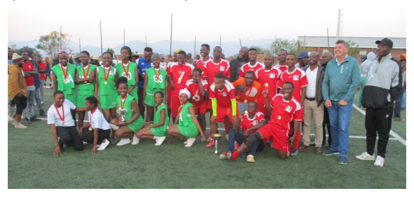
Figure 3: Annual Soccer and Netball Tournament a resounding success

In late June 2023, a Facebook page (https://www.facebook.com/SouthernPalladium) was launched to provide project updates, news and relevant information with the Community in a more accessible and real-time manner.