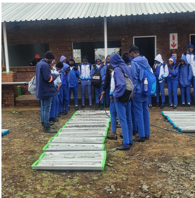
Figure 1: Local School Visit

Southern Palladium works closely with the community, actively promoting inclusivity and project awareness. Ethical inclusion extends to fair representation of local stakeholders via Royal Family, Traditional Council and other Community representatives. Periodical progress meetings are held virtually with the two Community representatives, together with the environmental and exploration management consulting firm contracted to the project. Quarterly meetings are held on site with extended representation from the local stakeholders. Southern Palladium remains sensitive to the needs of the community and proactively incorporates feedback into decision making. As the Project activities expand, opportunities for improved structures and channels are currently being identified and developed.