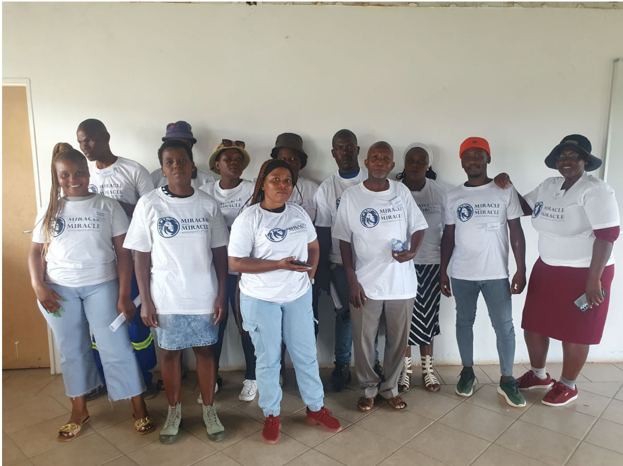
Figure 2: Local Team who completed the survey across villages to determine baseline information in support of the Company SUDP

A social and labour plan for 2024 has been developed for the Bengwenyama Project in compliance with the requirements of the MPRDA, the Mineral and Petroleum Resources Development Regulations, 2004 (GN R527 of 2004) and the Mining Charter, 2018 to promote social and economic development through targeted initiatives and projects. To date, Southern Palladium has completed a