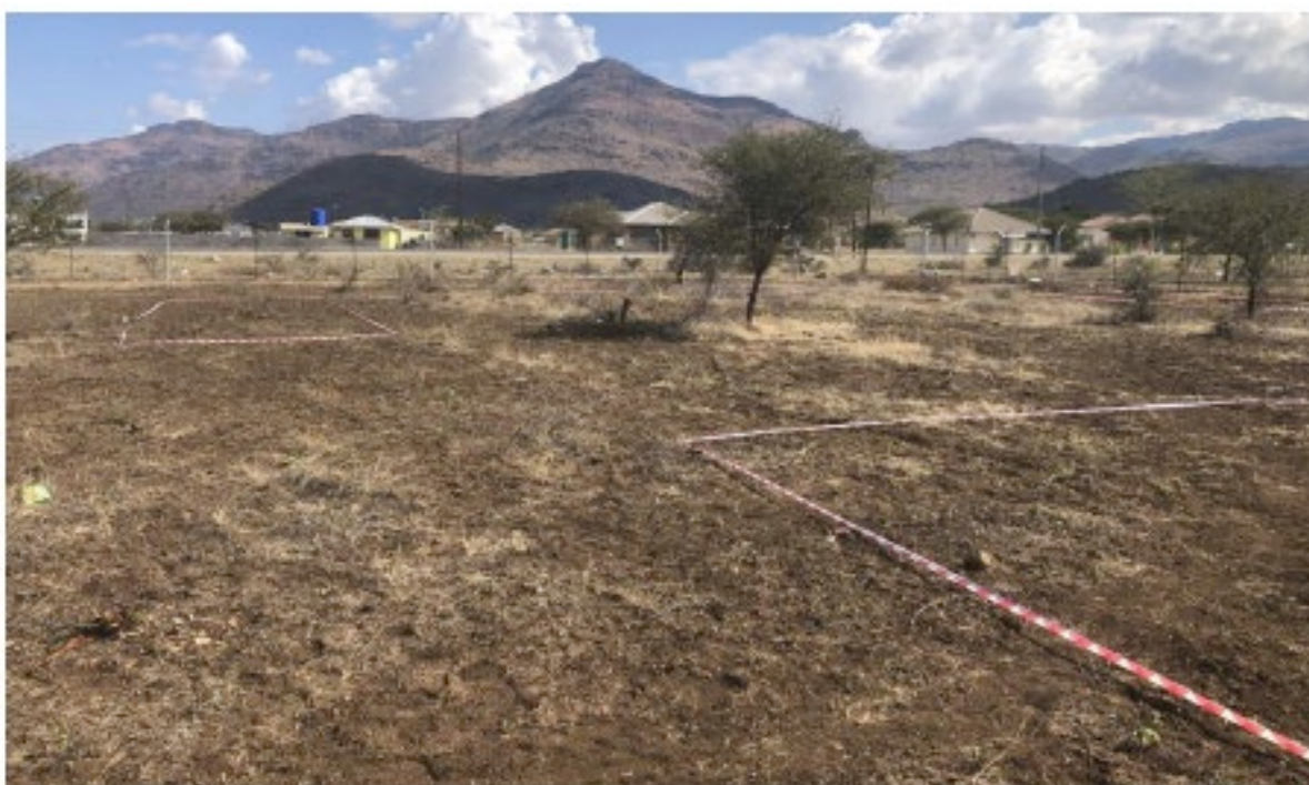
Contractor GeoMech has set out its laydown area to commence drilling within the newly-constructed security fence

Preparations at the site are underway after the Company awarded a drill contract to Geomech Africa (Pty) Ltd, following a successful tender process.