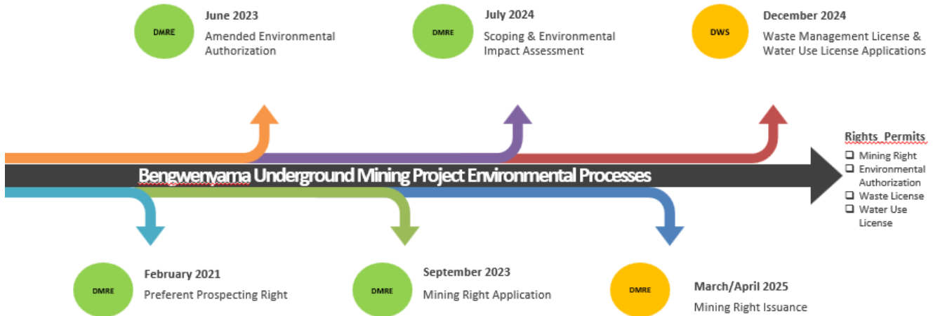
Figure 4: Mining Right Application Timelines

Additional permit applications are in progress, including a Waste Management Licence (“WML”) application and a Water Use Licence (“WUL”) application, which will be submitted for water uses associated with the Bengwenyama Project.