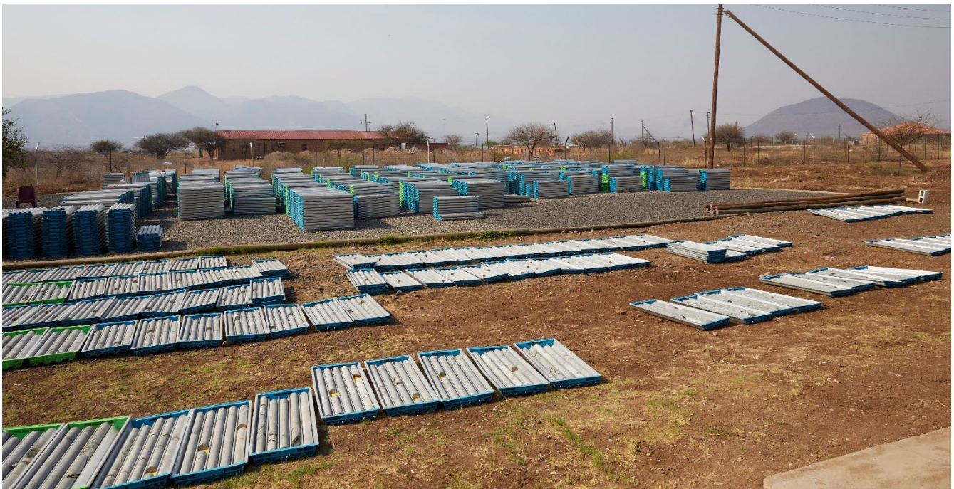
Figure 1: Core yard at the Operational Offices

The drilling campaign has been highly successful leading to an improved geological understanding of the project and increased confidence in the Mineral Resource. This success has resulted in the declaration of Measured and Indicated Mineral Resources with the conversion of Exploration Targets in the remaining project area into an Inferred Mineral Resource.